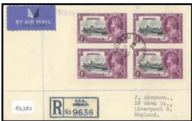
Dominica 1/- (Roseau 22.11.35)