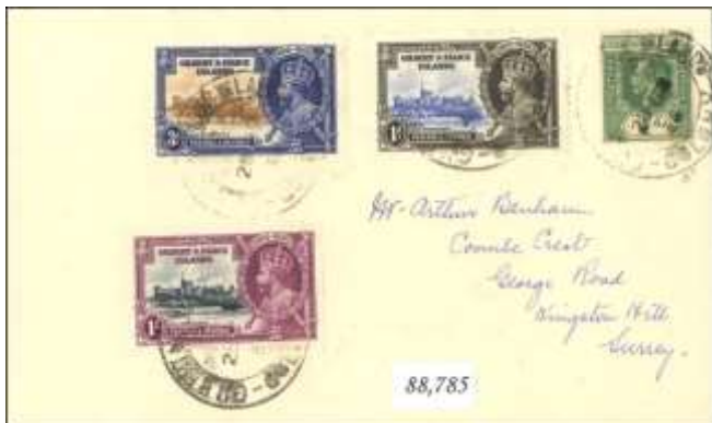
Gilbert & Ellice 1d (28.10.35)