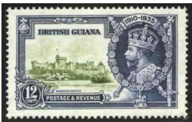
British Guiana 12c

Perhaps we can look forward to additional prices being included in the 2018 and 2019 editions of the Part One catalogue.