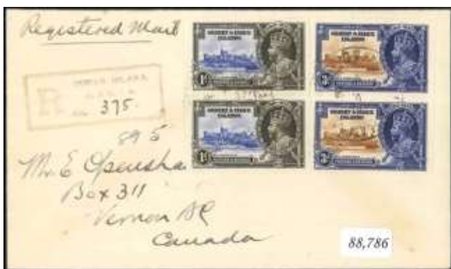
Gilbert & Ellice 3d (Reg Ocean Is 4.2.36)