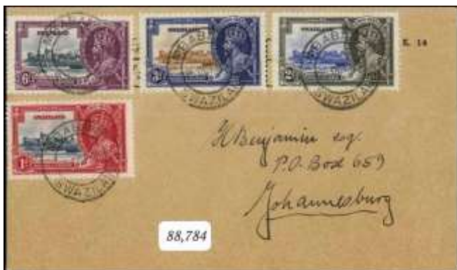
Swaziland 6d (Mbabane 25.10.35)

Flagstaff on right-hand turret Bv5.7/1 (SG: -d)