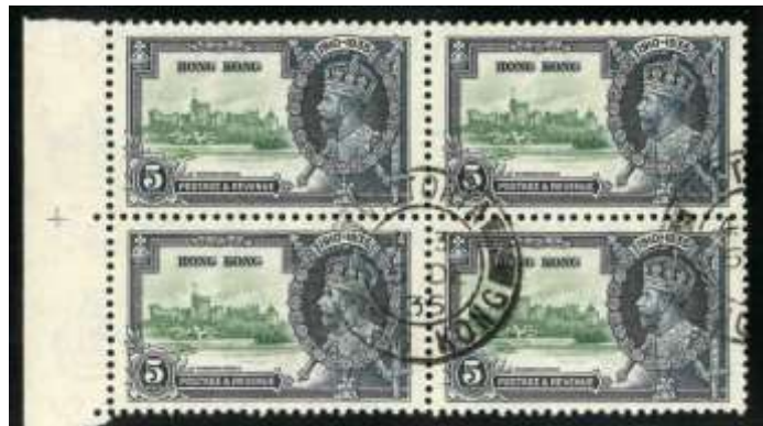
Hong Kong 5c (Victoria 5.12.35)