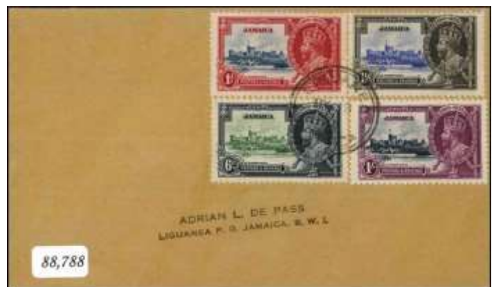
Jamaica 6d (Liguanea 18.5.36)