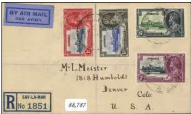
Jamaica 1/- (Sav La Mar, b/s Kingston 28.12.35)