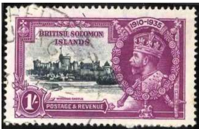
British Solomon Islands (RPSL Ltd certificate)