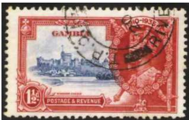
Gambia 1 1/2d (River Gambia T.P.O. cds)