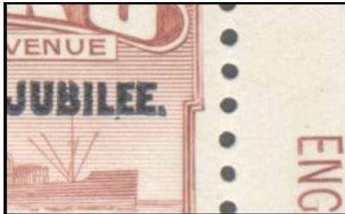
One shilling with split B