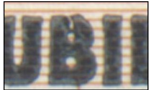
A tuppenny example with the start of a split B

Though not from a positional block, the 2d in the fourth illustration appears to show the beginnings of the same flaw.