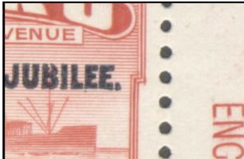
Penny-halfpenny with split B

Best known of Nauru's varieties is probably the split "B" of the overprint which occurs at position 4/12, (the stamp next to the top of the imprint on the right-hand side of the sheet). The handbook indicates its occurrence on all four values but it is generally regarded as not appearing on the 2d value, as the imprint blocks of this denomination seem to show.