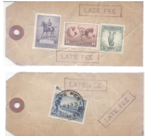
2/- tied (just) to a parcel tag by a boxed Late Fee hand stamp along with, from other issues, 1/6, 1/- and, on the reverse, a 3d tied by an unclear Late Fee cds for 4 Je 35.

Most Jubilee denominations were selected for their relevance to postal rates current at the time. With Australia's 2/- value, its intended use is somewhat obscure. On its own, it could be used for an airmail postcard to Bolivia or Peru, or an airmail letter to certain European destinations where air transport additional to the standard service was needed, or a similar letter to the U.K. with registration for compensation from £5 to £10, or certain parcel categories. Even in combination with other values, the 2/- is difficult to find on commercial mail.