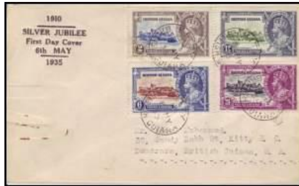
Set on a dedicated first day cover, each cancelled by Kitty (Demerara) single ring cds for 6 My 35